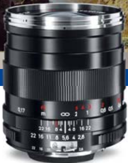
Picture shows ZF mount